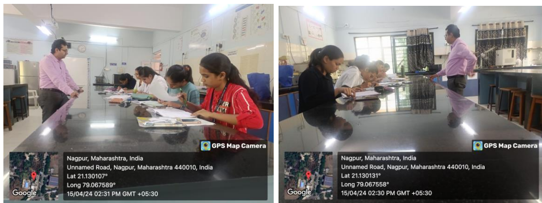
UG Lab projects